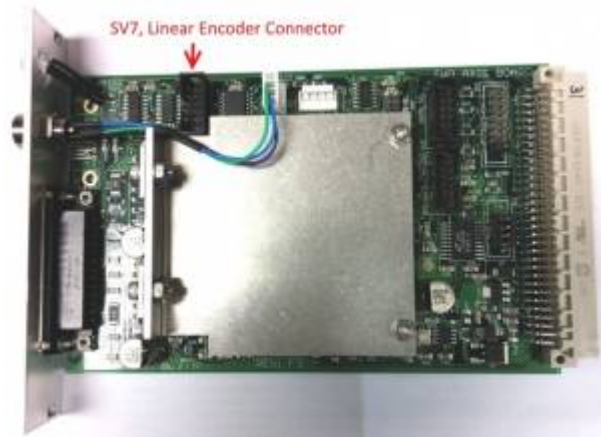
Figure 2: Two axis card with Linear Encoder Connector shown

Note: Connecting Linear Encoders to the wrong Buffer card may cause permanent damage. Please check and contact ASI if you are unsure.