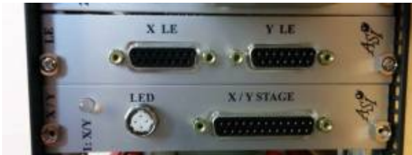
Figure 4: Placement of LE buffer card and Two Axis card

In the Schroff case, install it next to the Two Axis card.