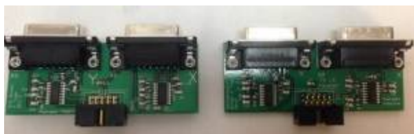
Figure 1: Linear Encoder Buffer card, Left card is for MicroE and Renishaw. Right is for Heidenhain

The following tech note will walk user thru installing, configuring and troubleshooting any issues related to the Linear Encoder Buffer Card.