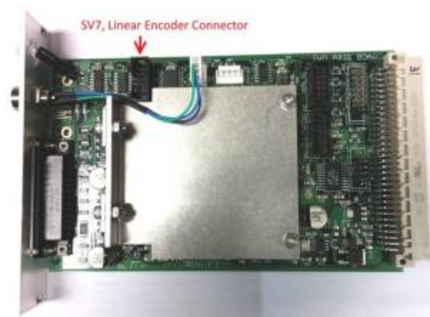
Figure 2: Two axis card with Linear Encoder Connector shown

Note: Connecting Linear Encoders to the wrong Buffer card may cause permanent damage. Please check and contact ASI if you are unsure.