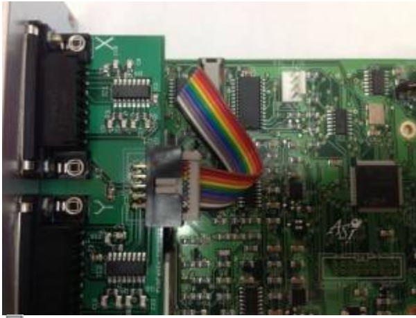
Figure 3 LE Buffer card and Two axis card are connected with a 10pin straight ribbon header connector