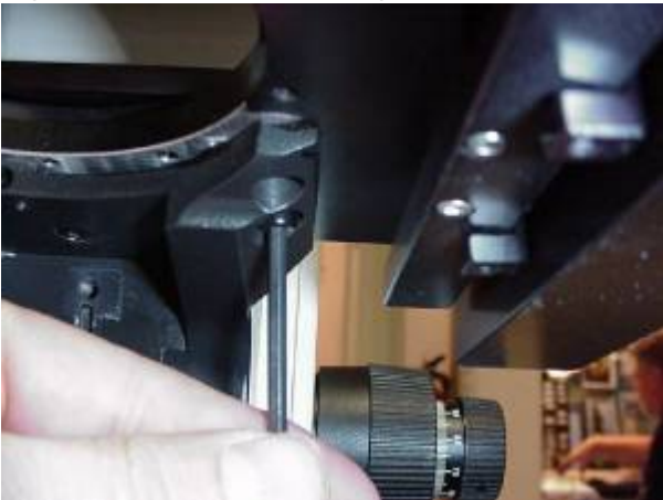
Figure 2c. Location of stage attachment screws