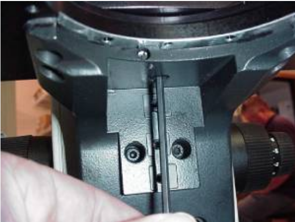
Figure 2b. Location of stage attachment screws