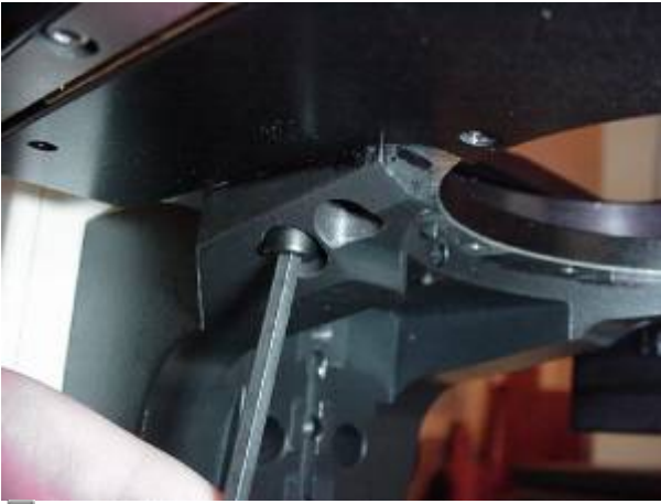
Figure 2a. Location of stage attachment screws