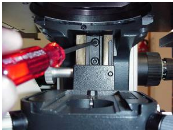
Figure # 1 Removing the condenser carrier

To gain access to the 3 ea. 4x8mm screws that secure the original mechanical xy stage the condenser carrier must be removed. Remove the condenser as outlined in your microscope's manual & rack the carrier all the way down as shown. Use a 3mm Allen wrench as shown in figure # 1 to loosen the two screws that secure the carrier to the microscope.