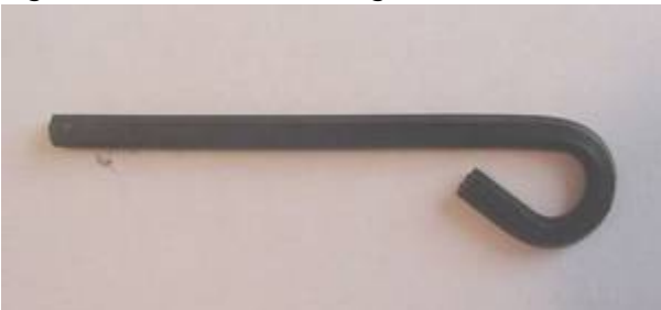
Figure 2d. 3mm Allen wrench