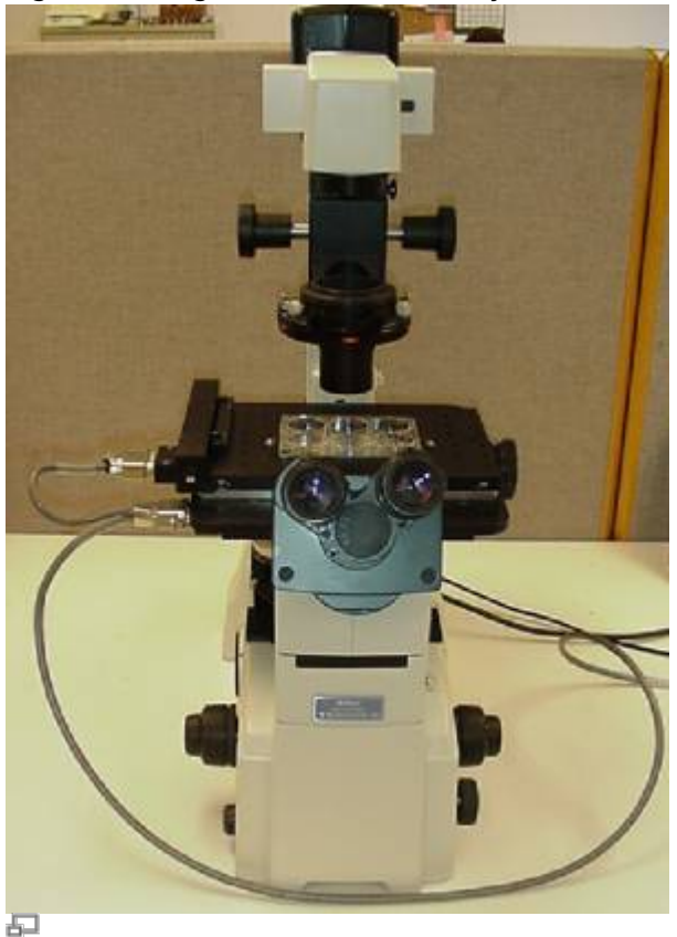
Figure 3. Stage mounted the WRONG WAY with the connectors & cables on the left side

Figure 2. Stage mounted correctly with connectors & cables on the right side