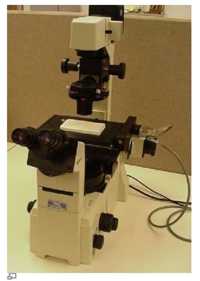
Figure 2. Stage mounted correctly with connectors & cables on the right side