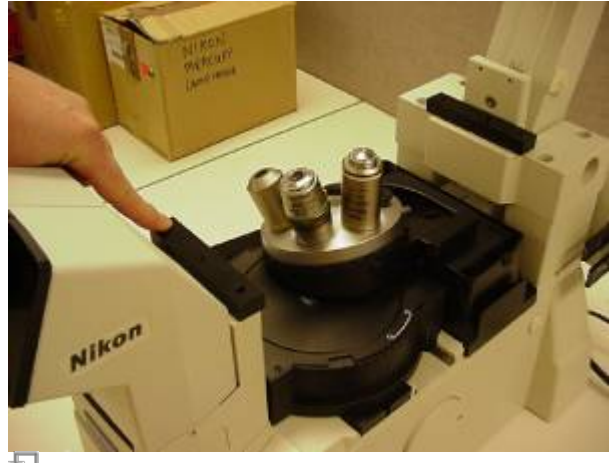
Figure 1. 12.75 mm stage spacers and 4ea. 5x25mm screws are required to mount the stage. On newer stages the spacers are attached to the stage.