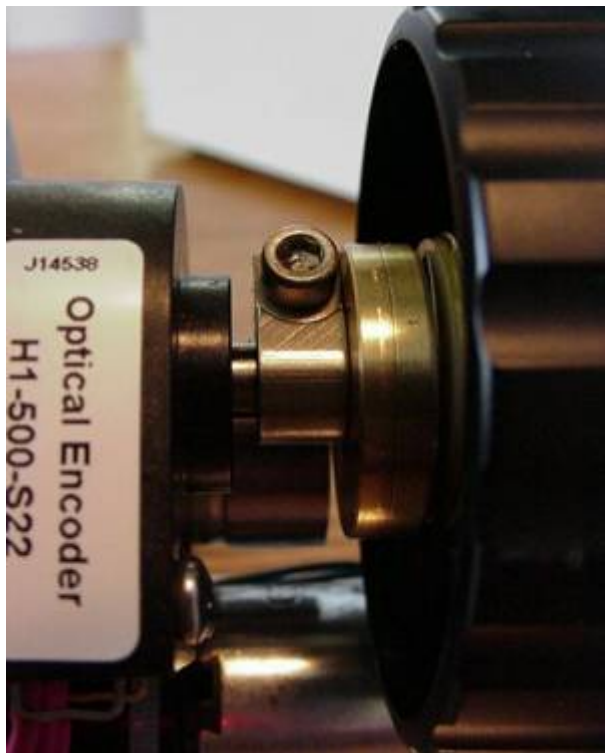
Figure 3. Brass Clutch plate