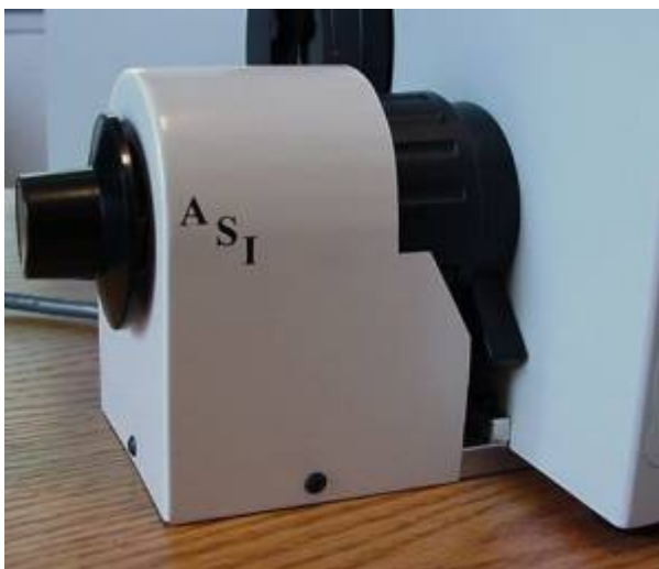
Figure 1. ASI drive Installed

Note: The Clamp Must Be Securely Tightened Or The Drive And Clutch May Slip.