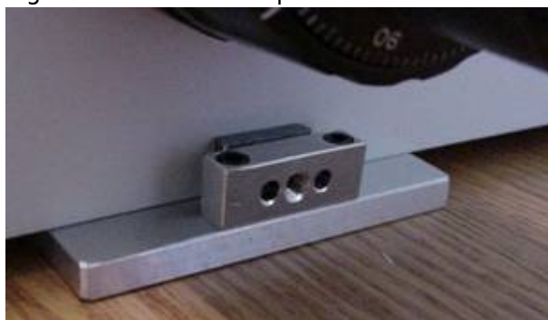
Figure 4. Base plate clamp assembly

6.) Slide the motor drive up and down, forward and backward slightly while turning the right fine focus knob until it is in the position where minimum drag is felt on the right focus knob. Secure the motor drive into position by tightening the horizontal and vertical adjustment screws.