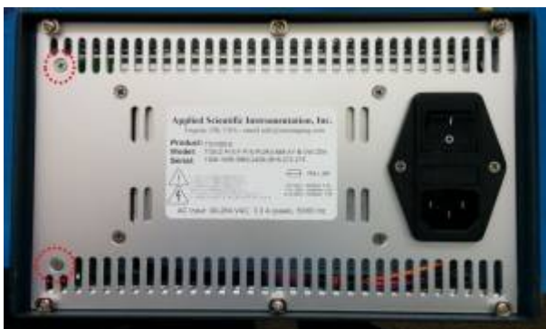
Figure 6: Location of Screws that hold power supply on Back panel in a TG-8 controller

Next unplug the white power supply connector. The next step is to remove the power supply board from the case. There are two methods. The easiest is to remove the two screws (location shown in pictures below) to remove the power supply from the back panel. However, in some systems the screws may be glued in place. If the screws don't easily release, unscrew the 4/40 nuts on the front side of the power supply board taking care not to loose the washers.