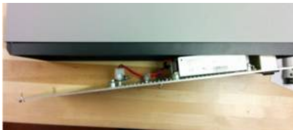
Figure 4: Pull out the back panel to access the power supply.