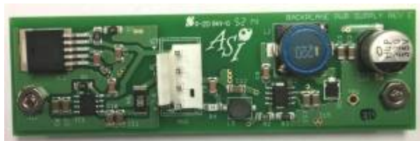
Figure 1: 5 volt Power supply used in TG controllers

The following technical notes shows how to replace the +5Volts and -5Volts power supplies used in TG-8 and TG-16 controllers.