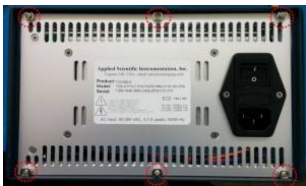
Figure 2: Location on Back panel screws on a TG-8 controller

To Access the power supply, unscrew the 6 schroff case screws shown in the pictures below.