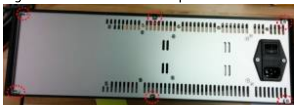
Figure 3: Location on Back panel screws on a TG-16 controller

Once the screws are removed you will be able to pull out the back panel to gain access to the power supply. Take care not to pull it out too much, as it may result in other connectors getting unplugged.