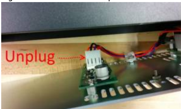
Figure 5: Unplug the Power supply connector

Next unplug the white power supply connector. The next step is to remove the power supply board from the case. There are two methods. The easiest is to remove the two screws (location shown in pictures below) to remove the power supply from the back panel. However, in some systems the screws may be glued in place. If the screws don't easily release, unscrew the 4/40 nuts on the front side of the power supply board taking care not to loose the washers.