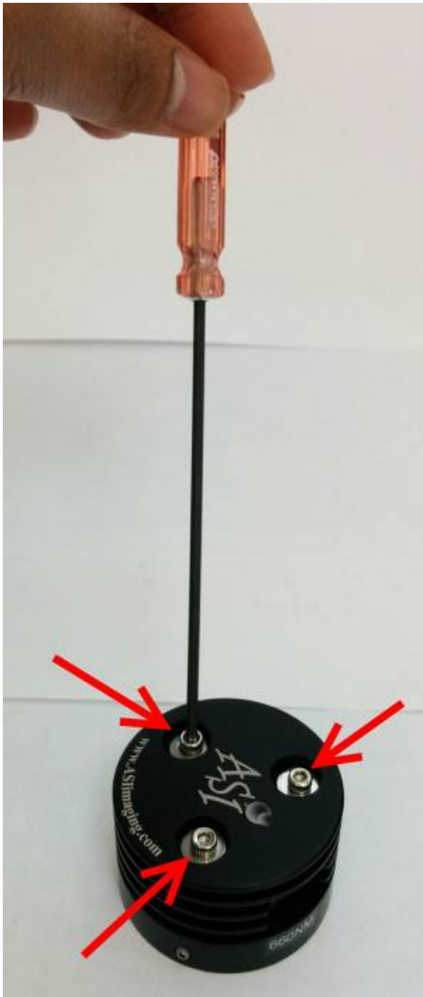
2.5mm Allen wrench to screw the three M2.5 screws