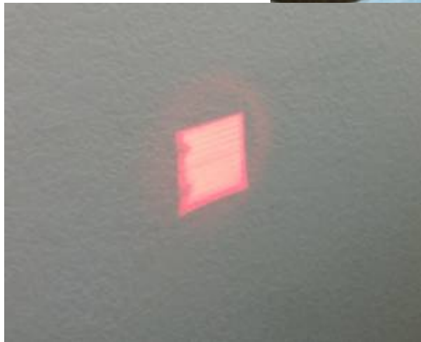
LED die image , focused on a distant wall

Assembly is complete, reattach the Illuminator back onto the scope. Contact support[at]asiimaging[dot]com for additional support if needed.