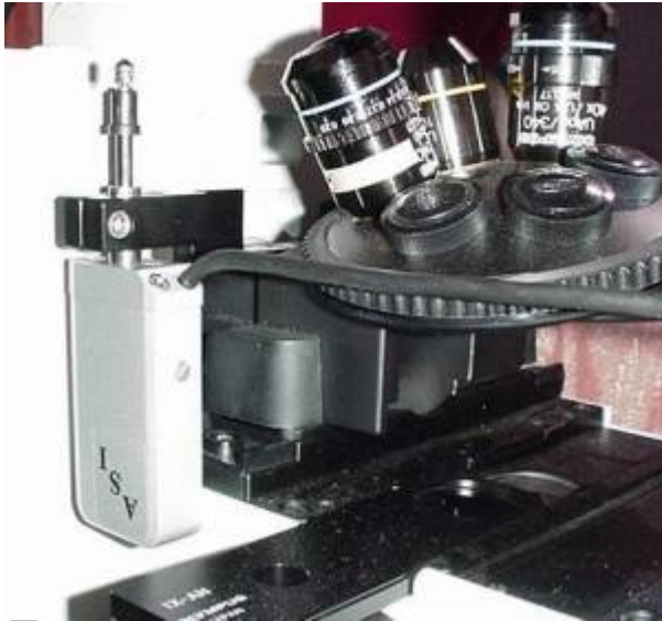
Figure 2a. Linear Encoder and stage mounted