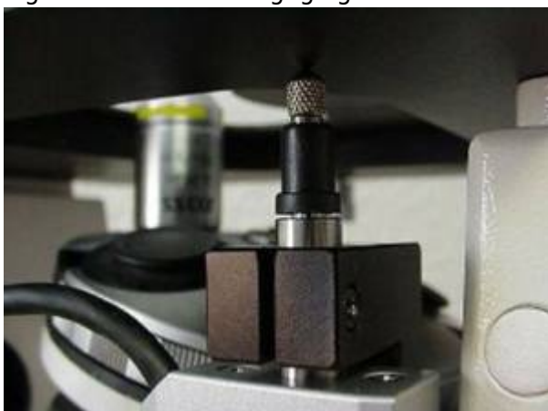
Figure c. Encoder alignment

Locate the Heidenhain encoder and the 3/32 inch allen wrench. Use the Allen wrench to insure that the screw on the side of the encoder clamp is loose. Bring the objective up to the upper most position. Slide the encoder into the large hole on the encoder clamp and position it so that the ball on the end