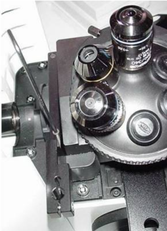
Figure 1b. Encoder clamp installed

To install the linear encoder the original stage must first be removed; please refer to your microscope's manual if needed. After the stage has been removed locate a Philips screw driver and use it to remove the two original screws that secure the cover at the rear of the turret as shown in figure 1a. Then locate the encoder clamp and position it across the objective turret mechanism of the microscope as shown in figure 1b. Use the two 3x25 mm screws and 2.5 mm Allen wrench to secure the unit in place. The encoder can be installed as shown, or installed in step two. If the encoder is installed as shown be sure to move the encoder down to allow room when mounting the stage.