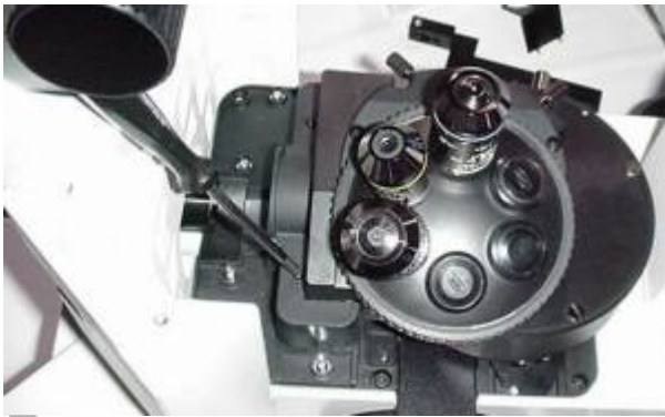
Figure 1a. Removing original screws