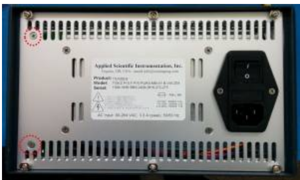
Figure 6: Location of Screws that hold power supply on Back panel in a TG-8 controller

Next unplug the white power supply connector. The next step is to remove the power supply board from the case. There are two methods. The easiest is to remove the two screws (location shown in pictures below) to remove the power supply from the back panel. However, in some systems the screws may be glued in place. If the screws don't easily release, unscrew the 4/40 nuts on the front side of the power supply board taking care not to loose the washers.