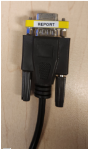
Straight through serial cable with gender changer

contact ASI to get a cable to split the connection between CRISP and the serial port.